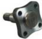
AXLE CARRIRER (REAR SIDE)