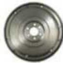
FLYWHEEL RING GEAR